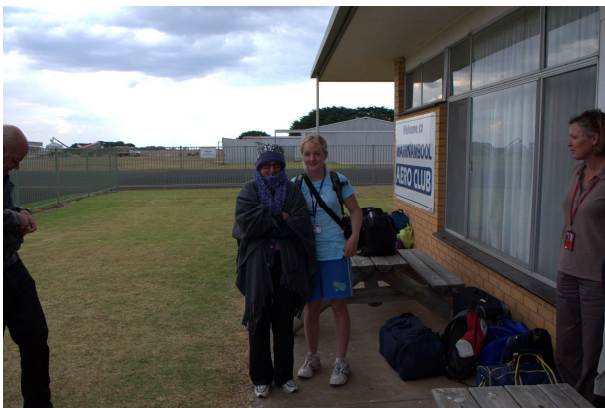
It's cold in Warrnambool