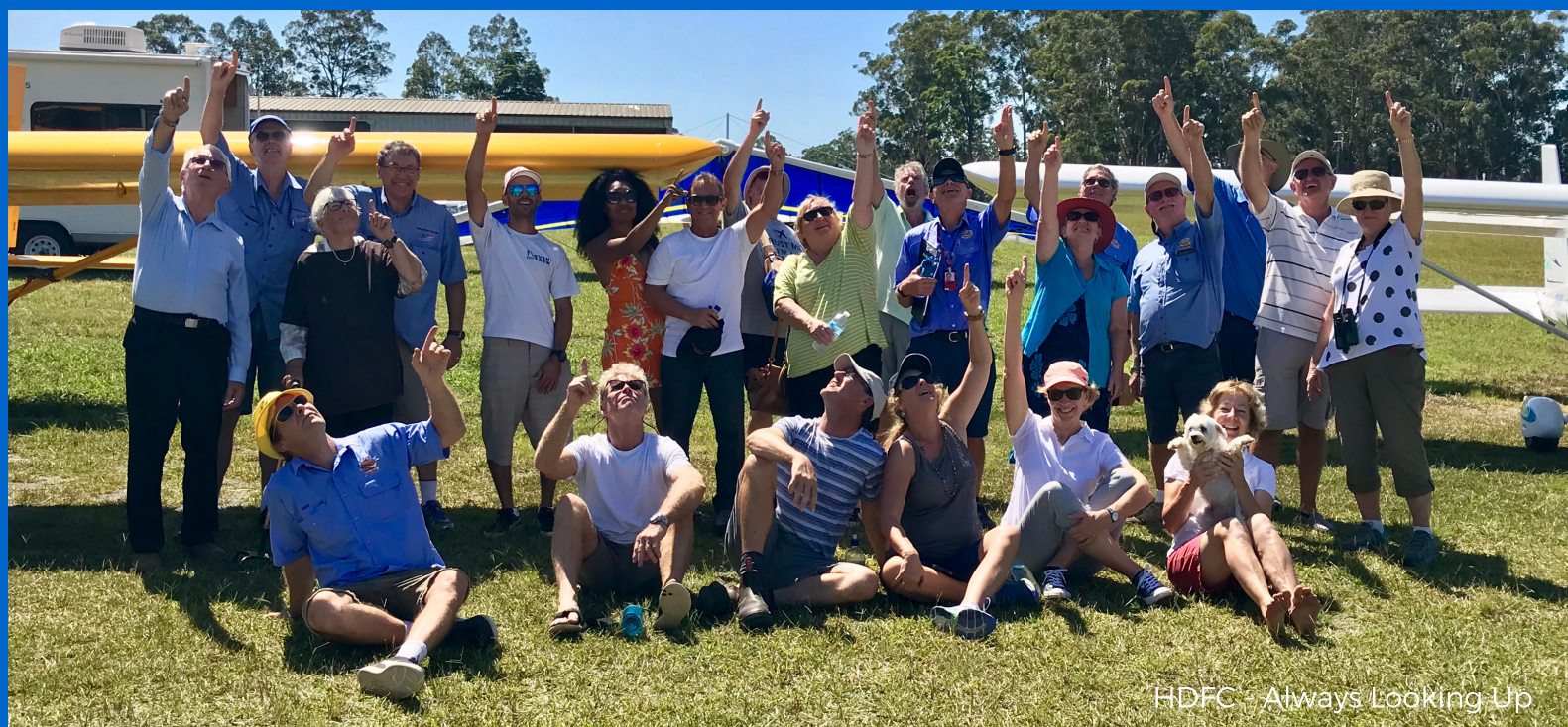
HDFC - Always Looking Up

Join HDFC now, where people who believe in your flying dreams come together since 1958.