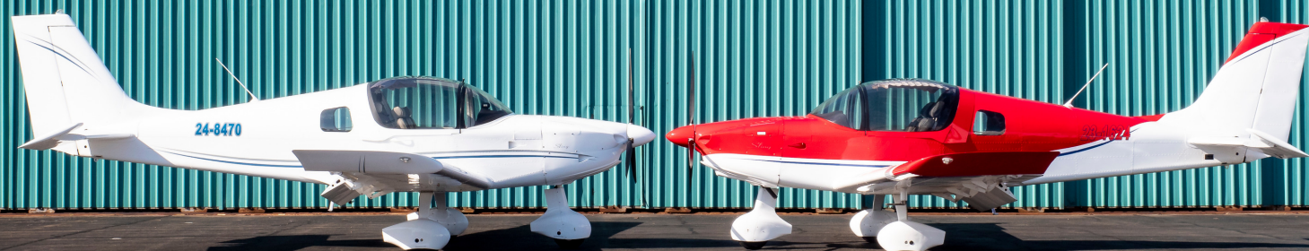
Our aircraft for hire - Sling 2